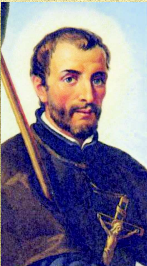
St. Francis Xavier (1506-1552)

F rom earliest times, Jesuits have been trendsetter in the field of education. They designed their education to address the needs of the time. In Ignatius's day it was to form a Catholic Community that was both erudite and virtuous. More than four hundred and fifty years since our first involvement in education, one might rightly ask what the issues are that we need to address today in order to make a difference in the field of education. They are undoubtedly many and varied and those that we shall address are not the only ones. Nevertheless they are the concerns that grip us today... environment, media, networking, dialogue, excellence, leadership, pastoral possibilities, lay collaboration, reflection strategies, national regeneration, building a community across borders, education of marginalised groups, education across borders and above all the spirituality of a teacher in a Jesuit school.